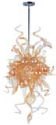
39723COPC Mimi LED 6-Light Pendant