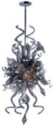
39723FMPC Mimi LED 6-Light Pendant