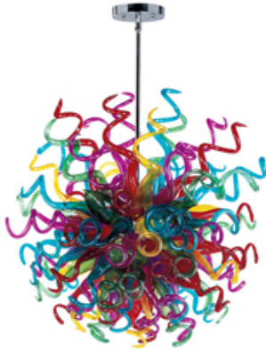
39735FEPC Taurus LED 18-Light Pendant