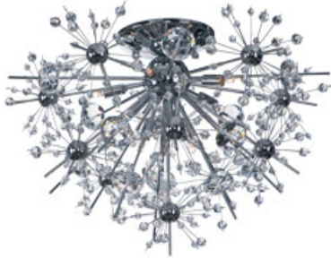
39740BCPC Starfire 8-Light Flush Mount