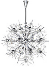
39745BCPC Starfire 11-Light Chandelier