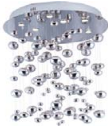
39853PCPC Dew 9-Light Chandelier