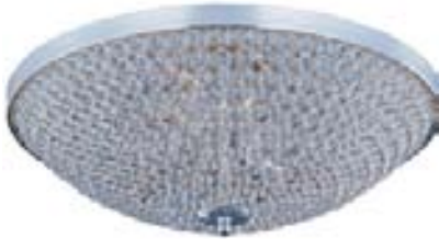
39873BCPS Glimmer 9-Light Flush Mount