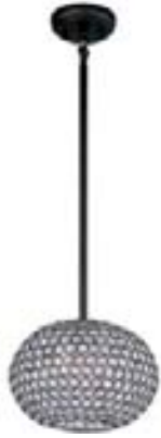
39877BCBZ Glimmer 3-Light Pendant