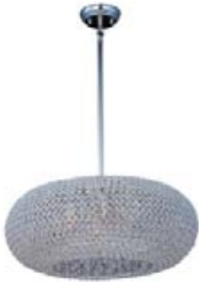
39879BCPS Glimmer 9-Light Pendant