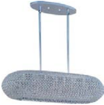
39880BCPS Glimmer 10-Light Pendant