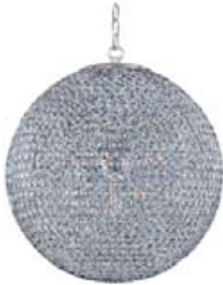
39887BCPS Glimmer 12-Light Chandelier