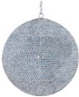
39888BCPS Glimmer 18-Light Chandelier