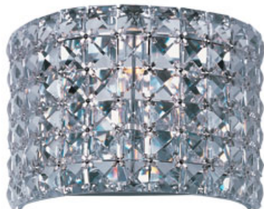
39938BCPC Vision 1-Light Wall Sconce