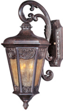
40173NSCU Lexington VX 2-Light Outdoor Wall Lantern