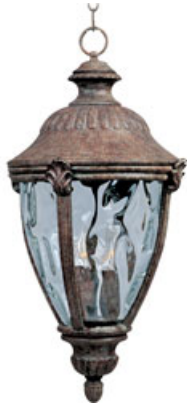
40291WGET Morrow Bay VX 3-Light Outdoor Hanging Lantern