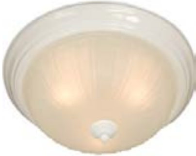
5832FTWT Essentials 3-Light Flush Mount