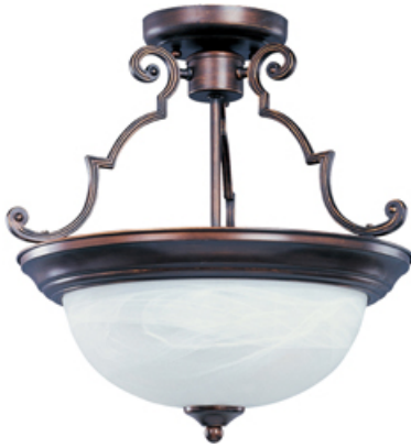
5844MROI Essentials 3-Light Semi-Flush Mount