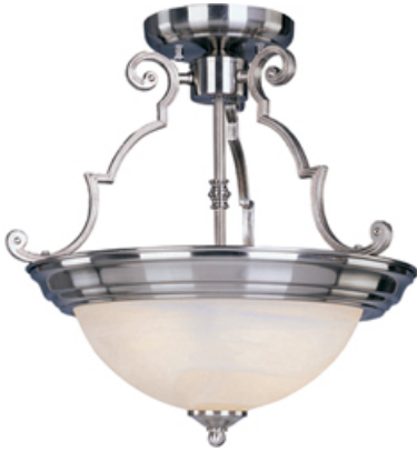
5844MRSN Essentials 3-Light Semi-Flush Mount