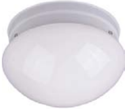
5880WTWT Essentials 1-Light Flush Mount