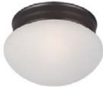
5884FTOI Essentials 1-Light Flush Mount