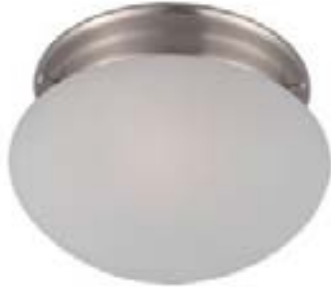
5884FTSN Essentials 1-Light Flush Mount