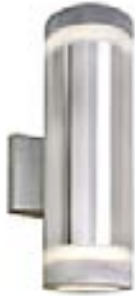
6112AL Lightray 2-Light Wall Sconce