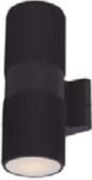
6126ABZ Lightray 2-Light Wall Sconce