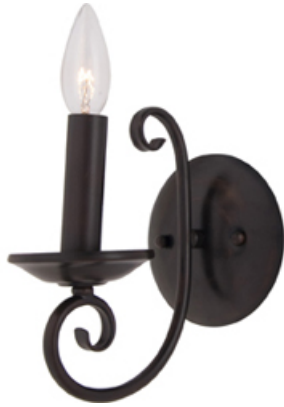
700010I Loft 1-Light Wall Sconce