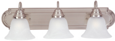
8013MRSN Essentials 3-Light Bath Vanity