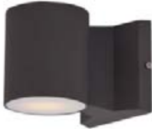
86106ABZ Lightray 2-Light LED Wall Sconce