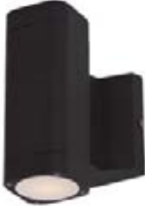
86109ABZ Lightray 2-Light LED Wall Sconce