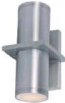
86117AL Lightray 2-Light LED Wall Sconce