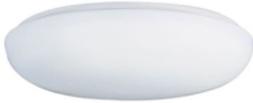
87201WT Low Profile EE 2-Light Flush Mount