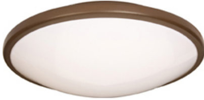
872100I Rim EE 1-Light Flush Mount