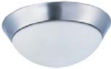
87562SWPC Mode LED Flush Mount