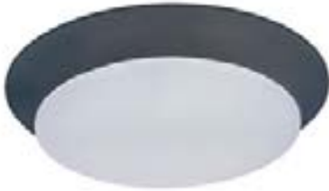
87592WTBZ Profile EE LED Flush Mount