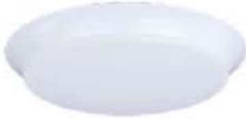
87598WTWT Profile EE LED Flush Mount