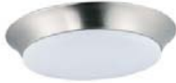
87599WTSN Profile EE LED Flush Mount