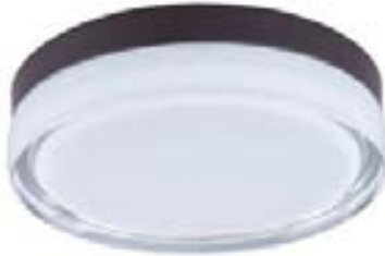
87632CLWTBZ Illuminaire LED Flush Mount