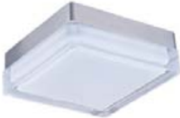
87644CLWTSN Illuminaire LED Flush Mount