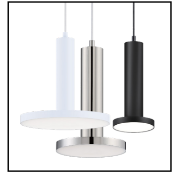
57600 PENDANT ACCESSORY (Sold Separately, Fixture NOT included)

Job Name : _____ Job Type : _____ Quantity : _____ Comments : _____